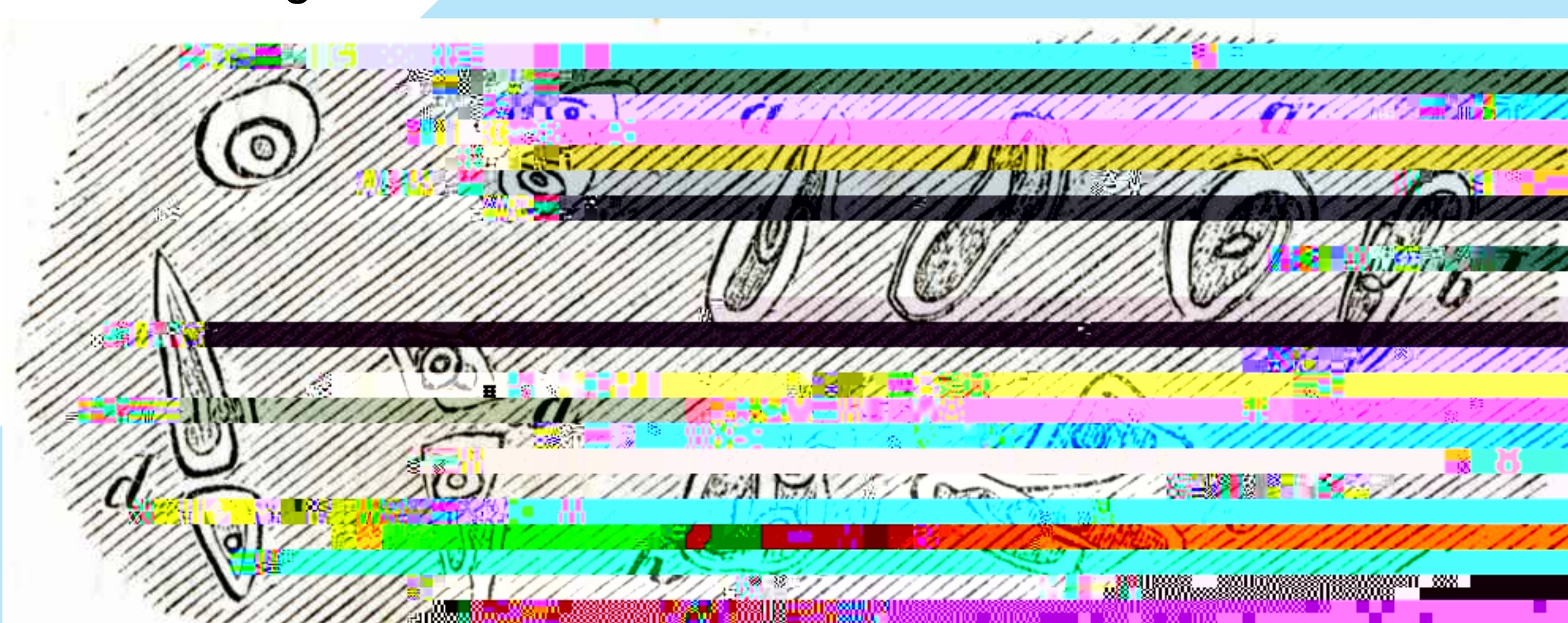
Cells dividing Virchow 1858

The cell theory established that cells are the fundamental units of living organisms, which arise through cell division, and that cells each have a nucleus and also material called protoplasm. But what is protoplasm and what is its role in life?