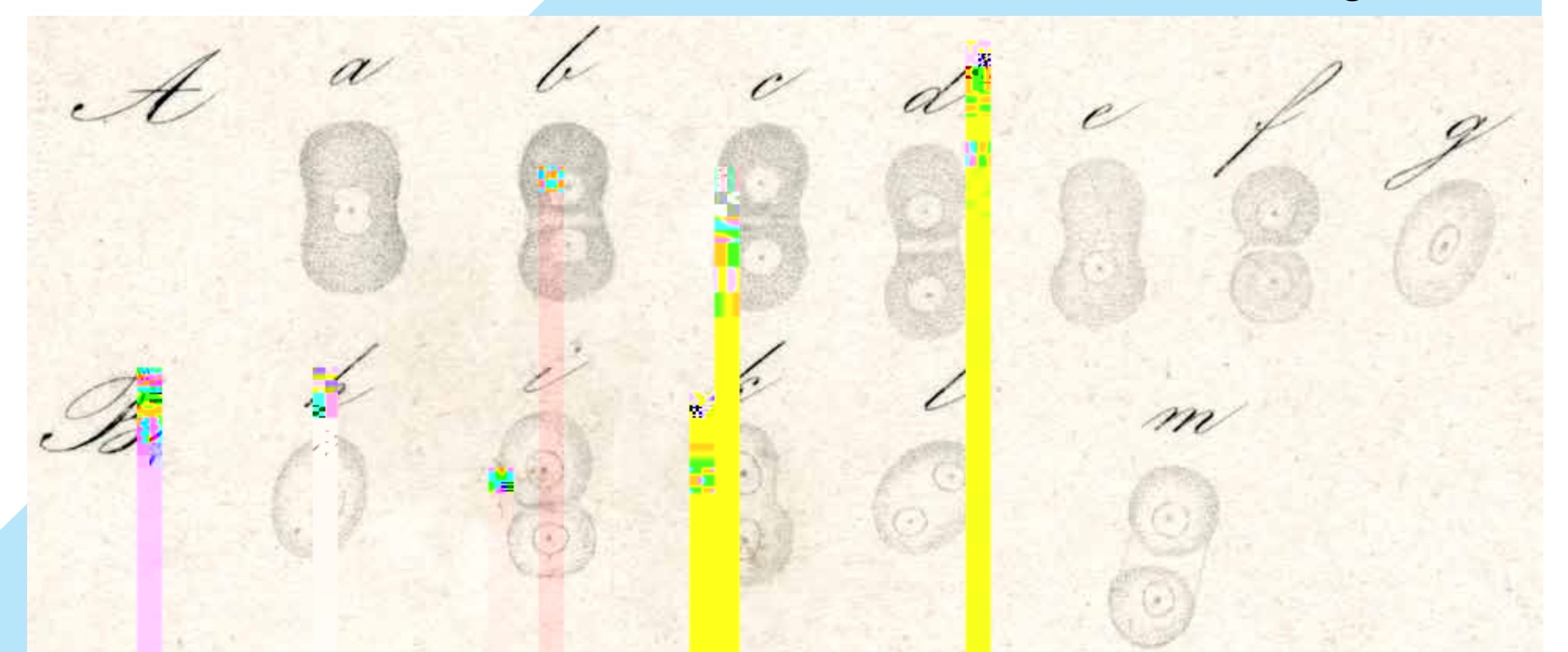
Cells dividing Remak 1855

In the 1850s, the Polish-German Robert Remak showed that cells arise by division of other cells, then German pathologist Rudolf Virchow popularized the idea. Though science does not progress through instant agreement with new ideas, this assumption became part of what was accepted by 1900 as the cell theory. The ability to observe cell division and represent it in images eventually persuaded others.